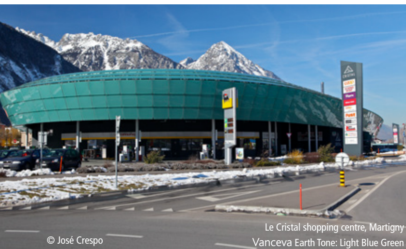
Le Cristal shopping centre, Martigny Vanceva Earth Tone: Light Blue Green