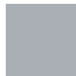
Medium Blue Grey

To resist fading, these PVB films are made with heat- and light-stable colorants. As a result, they are ideal for both interior and exterior applications, including balconies, curtain walls, atriums, skylights, partitions, and conference rooms.